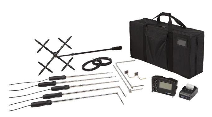
Model 8715 (Micromanometer shown with standard and optional accessories )

The 8380 AccuBalance Air Capture Hood includes a detachable 8715 micromanometer—one of the most advanced, versatile, and easy to use micromanometers on the market today. The 8715 features an auto-zeroing pressure sensor that increases measurement resolution and accuracy along with an intuitive menu structure for ease of operation.